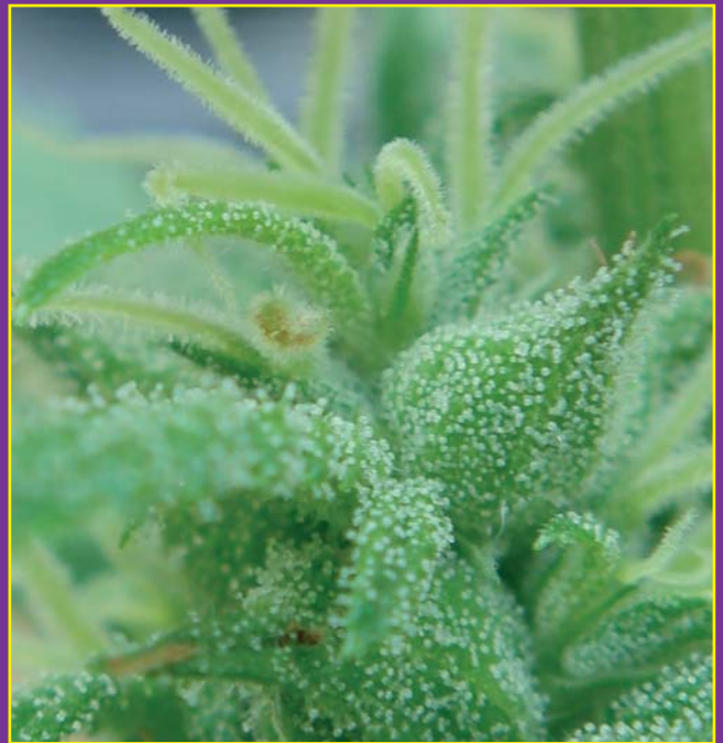
A small flower cluster of Mango Haze impregnated with developing seed

general issues to do with buyers of seed. This survey was taken over the passed year, 2007-2008 and used over 150 different individuals in the sample size.