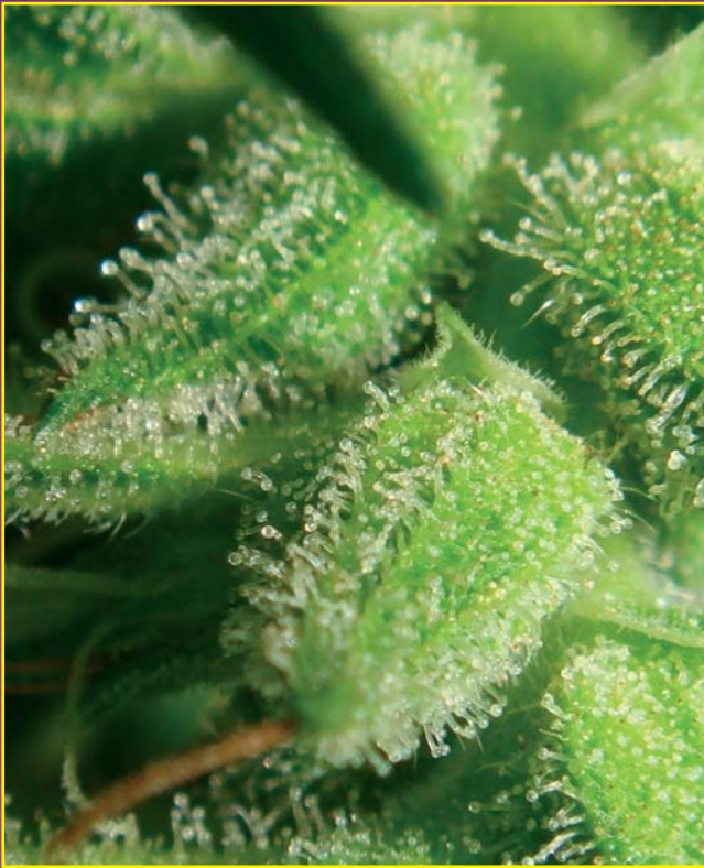
Mr Nice SSH with developing seed pods protected by resin glands