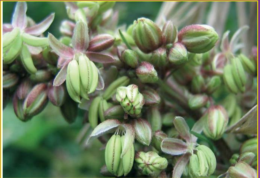
MNS Devil male flower in bloom

So why then are certain groups of growers beginning to revert back to regular seeds to find males? It would seem that the general public who grow female seed do it to produce a dried flower. Most regular seed growers wish to control what goes into their medicine, especially organic growers or people who do not want to use dried flowers from other sources as they feel they want to control what makes up their final product. The more inexperienced growers or first timers are the bigger proportion of female seed buyers while the more experienced growers seem to choose strains that are originating from true breeding land races.