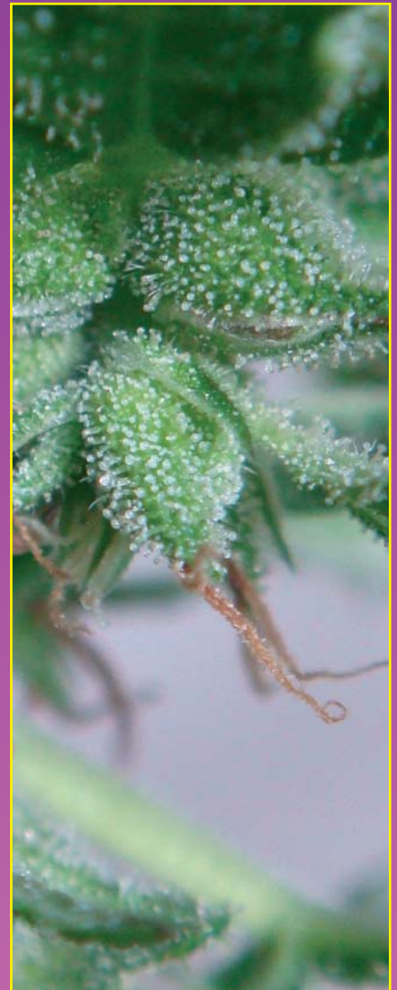
Mr Nice SSH growing seed

It is easy to gain the information on how to make female seed or regular seed and since this plus genetic material have demystified basic Mendelian genetic breeding a lot of people who began growing for one reason got trapped and lured into becoming self taught plant breeders as a consequence of getting involved in growing their own medical plants, or simply their hobby became their passion. When I see this occur it usually means that these people are in it for