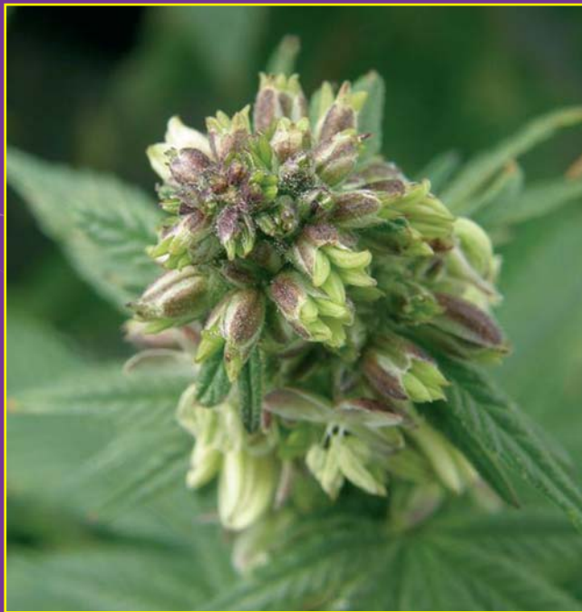
MNS Devil male flower in bloom