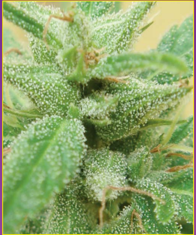
True Female protected by resin glands

the real reasons and their experiences plus a lot of chat amongst the growing community leads them to an answer, no matter what advertising campaigns or enticements they receive from seed companies to buy certain brands of seed. Genetics do not lie!